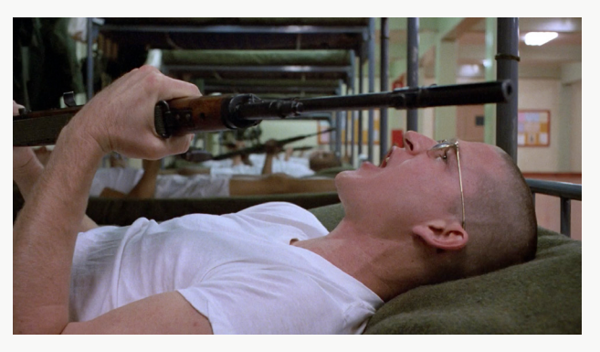
... There are many like it, but this one is... line?

It's really an embarrassing moment in my life. I will never show up on set and not know, like, the whole script, just in case they change the scenes, because it was really, really humiliating.<sup>6</sup>