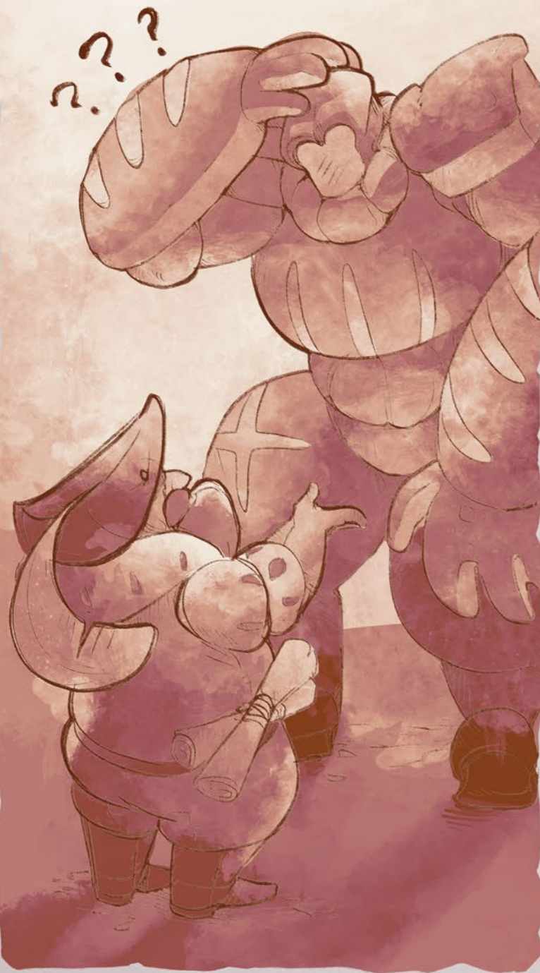
CLUE 3. SLEAZY LEGALESE