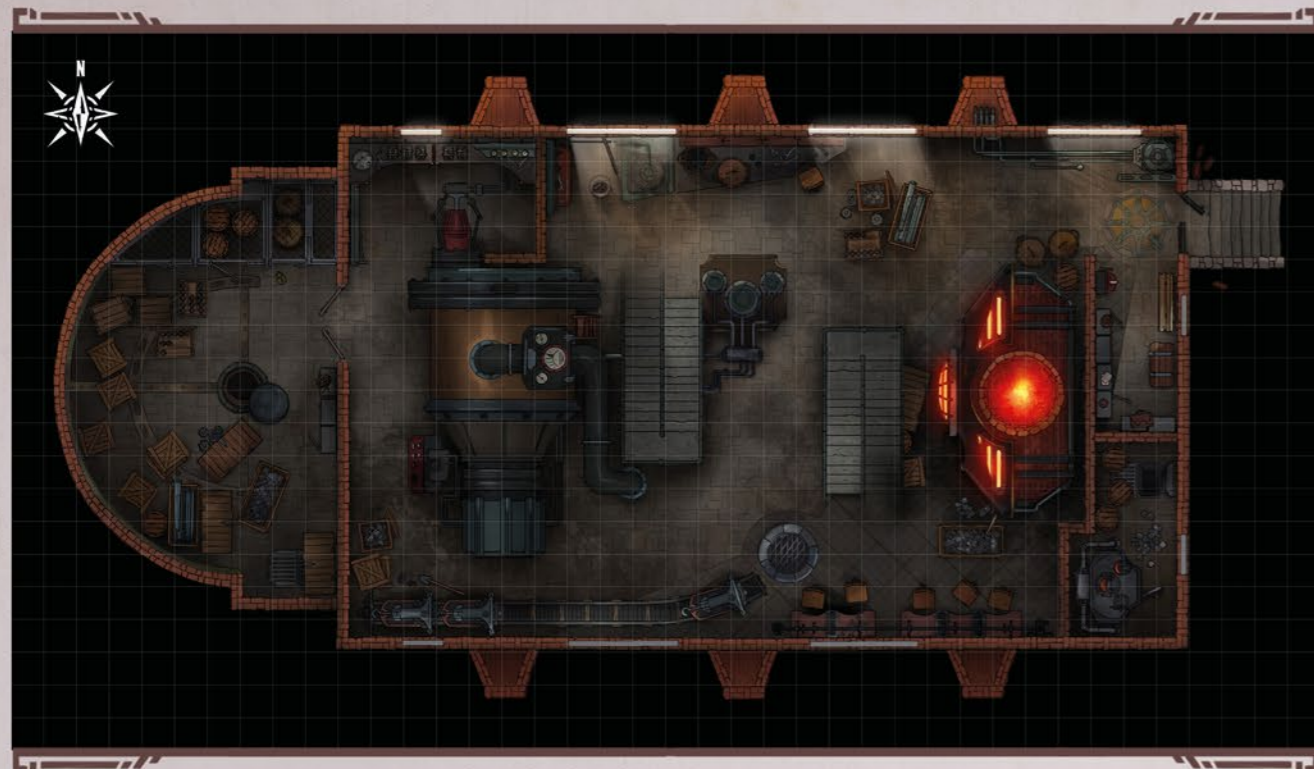
MAP 1. BREADSMITHY GROUND FLOOR