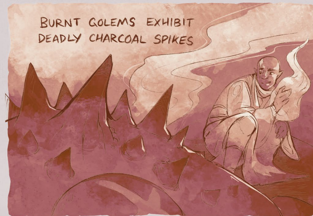
CLUE 2. TOASTED BUNS

Talking with Rifika or a successful VDC Intelligence (Arcana, Investigation, or Nature) check reveals that these changes occurred after he slashed them with his radiant sword and used fire magic on them. He recommends avoiding these damage types.