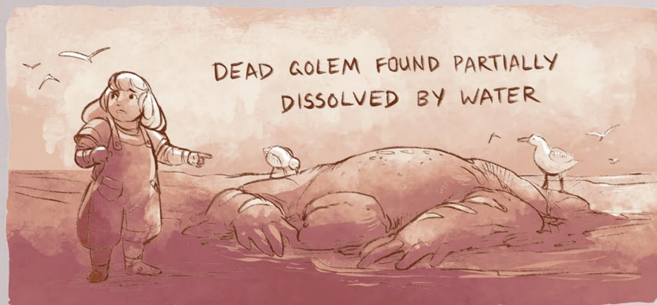
CLUE 1. SOGGY BOTTOM

Any spell or effect that creates water (like the create or destroy water spell) or uses water as a weapon (see water cannon and water whip , Appendix B) can trigger the bread golems' Soggy Bottom trait. Alternatively, a creature can use an action to make a Strength (Athletics) or Dexterity (Acrobatics) check contested by the creature's Strength (Athletics) or Dexterity (Acrobatics) check to upend a container of water it is holding onto a creature within 5 feet of it. If the creature with the canteen wins the contest, the golem's Soggy Bottom trait is activated.