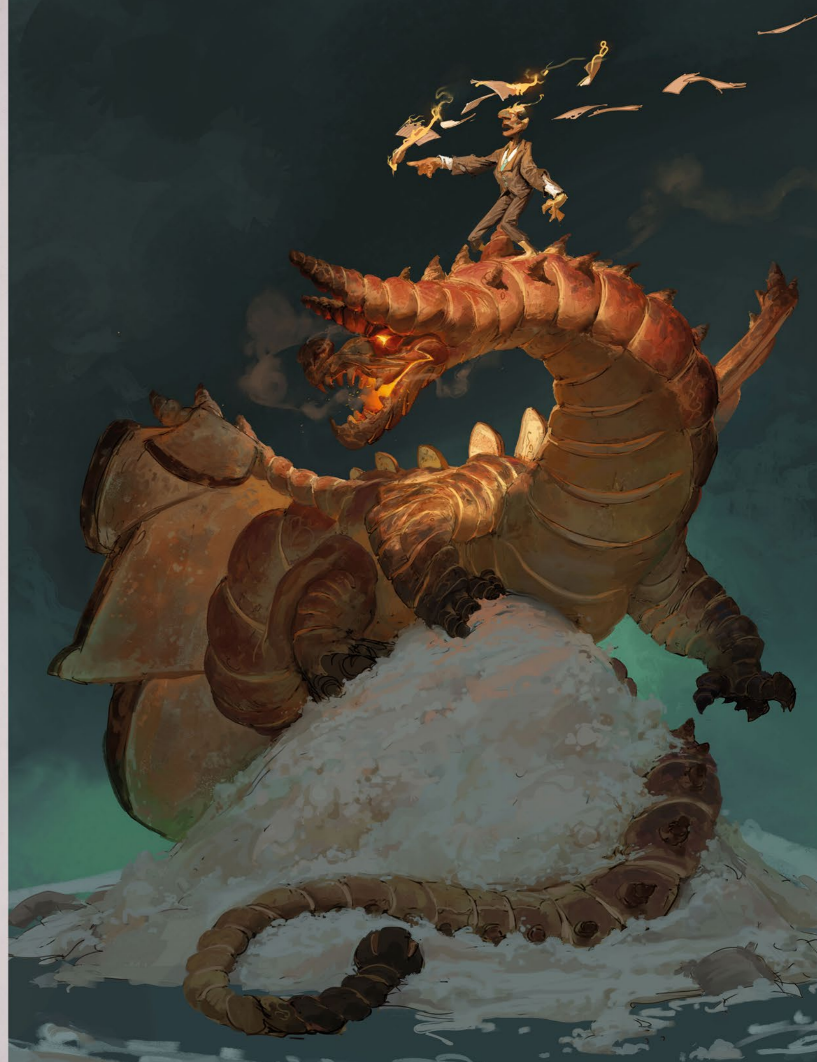
OPPOSITE: OGNEN SPORIN

If the dragon dies, these effects fade over the course of 1d10 days.