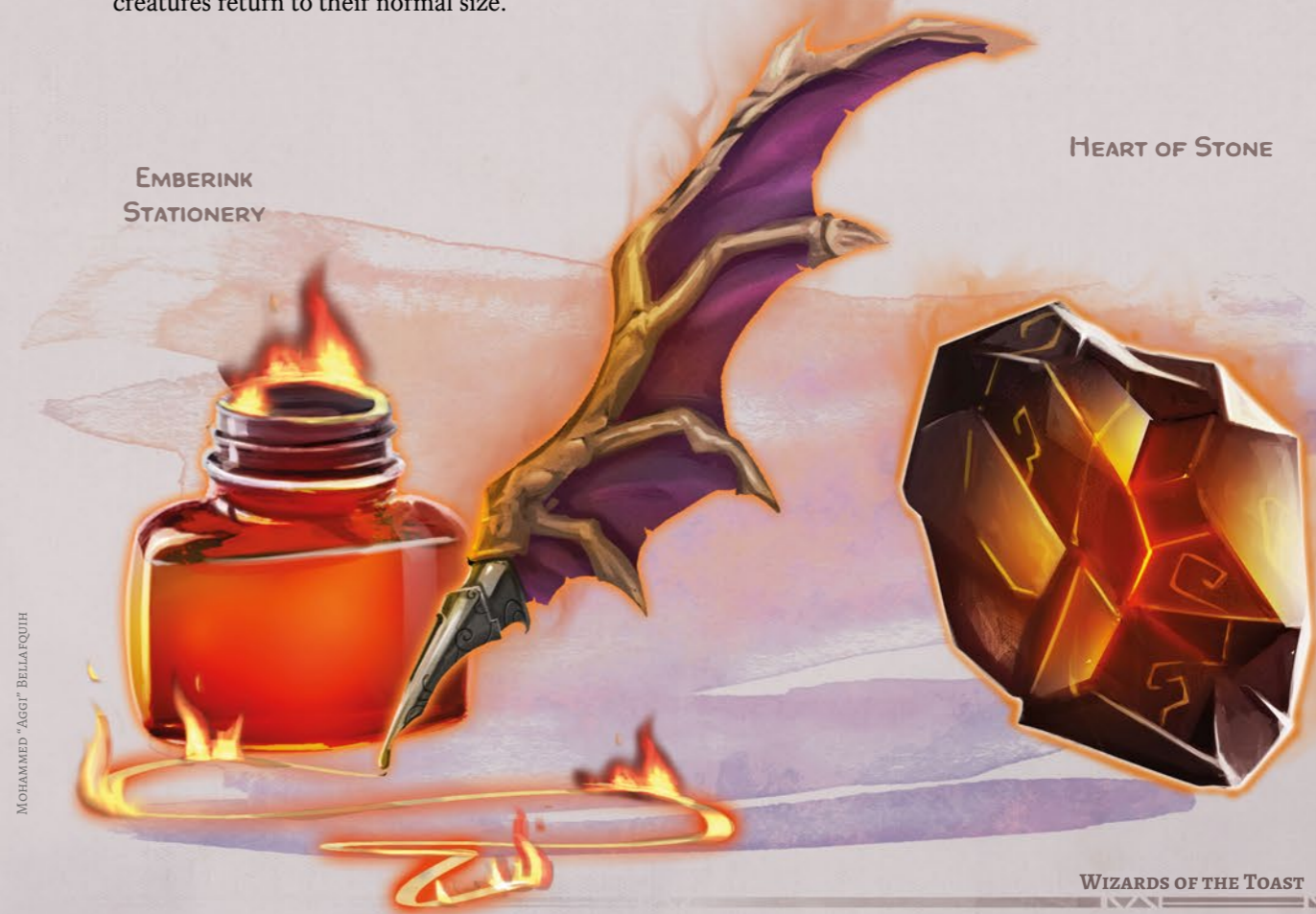
HEART OF STONE